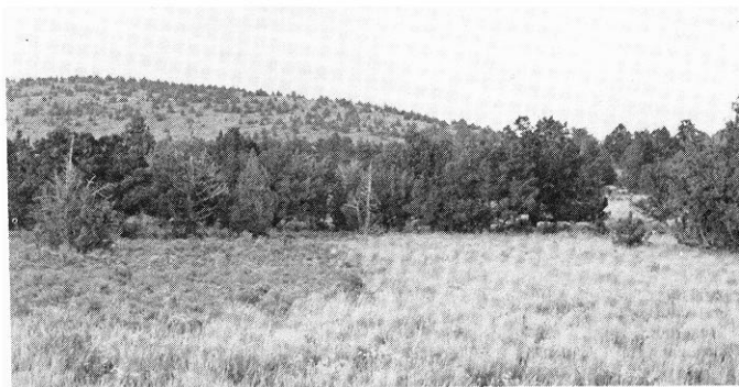
Fig. 1. Plot-line contrast 2 years after aerial application of tebuthiuron pellets at 4 kg/ha (left) for western juniper control with untreated plot (right).

The application of tebuthiuron to individual trees was considerably more effective for western juniper control than were broadcast applications (Table 3). Young trees (< 2 m tall) were highly susceptible to the 20 and 40 g/tree rates. There was no significant differences in the response to these herbicide rates and either killed over 80% of the smaller trees. Trees less than 2 m tall are generally less than 50 years old (Britton 1979, unpublished data).