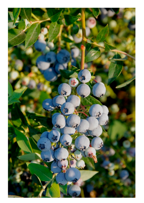
Fig. 2. 'Baby Blues' fruit cluster.

'Baby Blues' under a minimal spray program has not been noted for any disease or pest problems. Plants have been regularly sampled for virus presence particularly BlShV. Since it was first selected in 1999, only two 'Baby Blues' plants have tested positive for BIShV and the first time was 2014. These positive plants were removed before they could be tested a 2nd year to confirm infection. The oldest plants, established in 2001 in a field with many BlShV-positive plants of other genotypes, have yet to test positive for BlShV. While 'Baby Blues' appears to eventually get BlShV, it is tentatively grouped with 'Bluecrop', 'Elliott', 'Jersey', and 'Legacy' as cultivars that are slow to become infected.