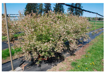
Fig. 5. A 13-year-old plant of 'Baby Blues' in full bloom.

An application for a U.S. Plant Patent has been submitted for 'Baby Blues' (U.S. Plant Patent Application Serial No. 14/545,561). When this germplasm contributes to the development of a new cultivar, hybrid, or germplasm, it is requested that appropriate recognition be given to the source. Further information or a list of nurseries propagating 'Baby Blues' is available on written request to Chad Finn (chad.finn@ars.usda. gov); USDA-ARS Horticultural Crops Research Unit; 3420 NW Orchard Avenue, Corvallis, OR 97330. The USDA-ARS and Oregon State University do not sell plants. In addition, genetic material of this release has been deposited in the National Plant Germplasm System as CVAC 2150, where it will be available for research purposes, including development of new cultivars.