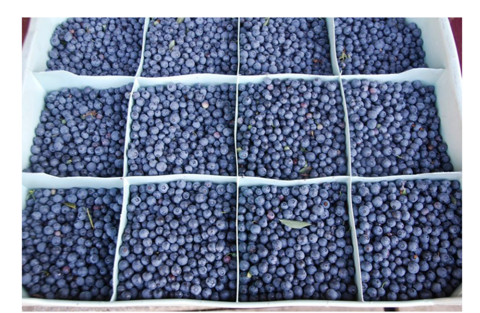
Fig. 3. Flat of 'Baby Blues' fruit harvested by hand.

'Baby Blues' has not exhibited winter injury in any region of the PNW since it has been planted—western Oregon (USDA Plant Hardiness Zone 8b) in 1997, Abbotsford, B.C., Canada (USDA Plant Hardiness Zone 8a), in 2006, Mount Vernon, WA (USDA Plant Hardiness Zone 8a), in 2001, and in Prosser, WA (USDA Plant Hardiness Zone 7a), in 2013 (USDA Agricultural Research Service, 2012). In southwest Michigan